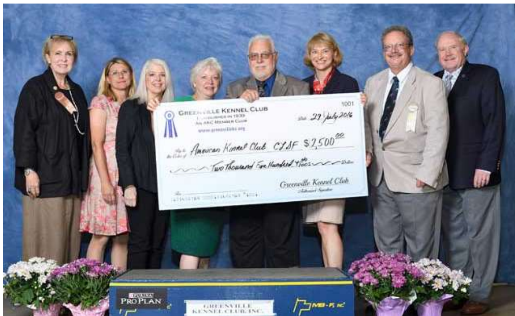
Presentation of GKC's $2500 contribution to the AKC Canine Legislative Support Fund