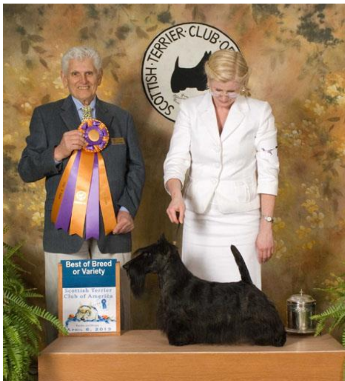
Ch Charhill Premier Performance

Her littermate Charhill Roman Empire was Best in Sweepstakes at the Scottish Terrier Club of Greater Atlanta.