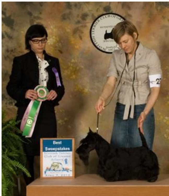
Charhill Roman Empire