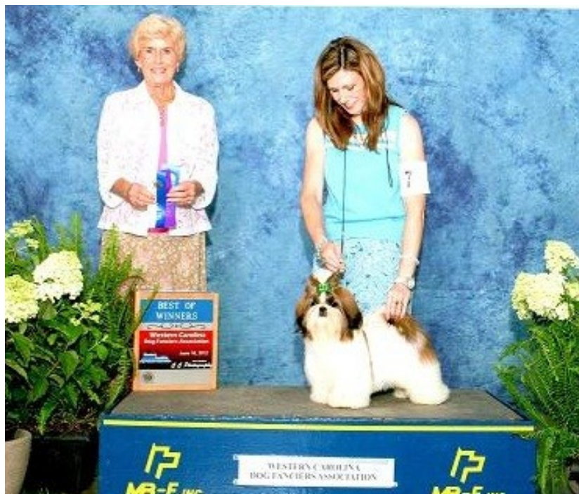
Demi's A Major "Mozart"

My 7 mo. old boy, Mozart, picked up his 1st points at the Waynesville, NC shows on June 16th & 17th.