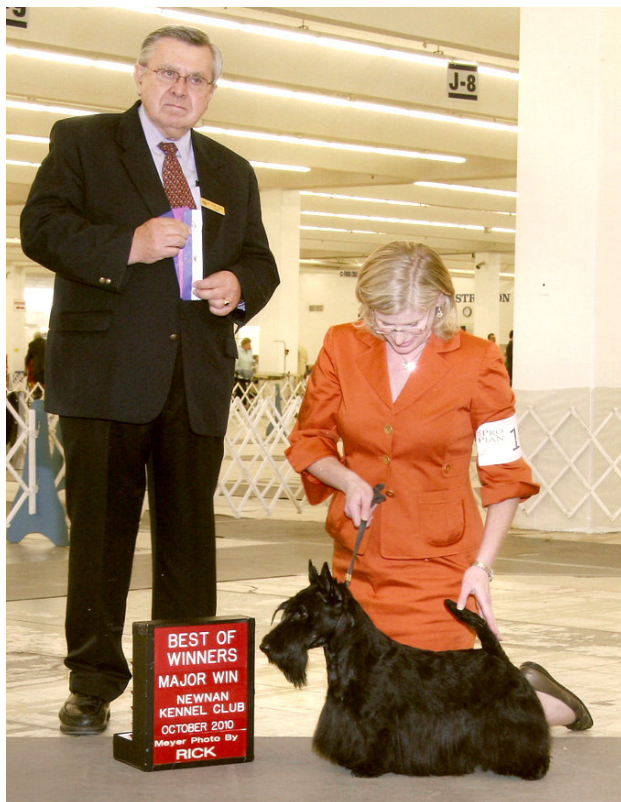
Charhill Top Billing

Celeste is 8.5 years old and we showed her at the specialty show of Scottish Terrier Club of Northern Ohio. She not only won the Veteran class, but went on to win Best of Opposite Sex over 5 other bitch specials. She flew around the ring and showed the young ones how it was done.