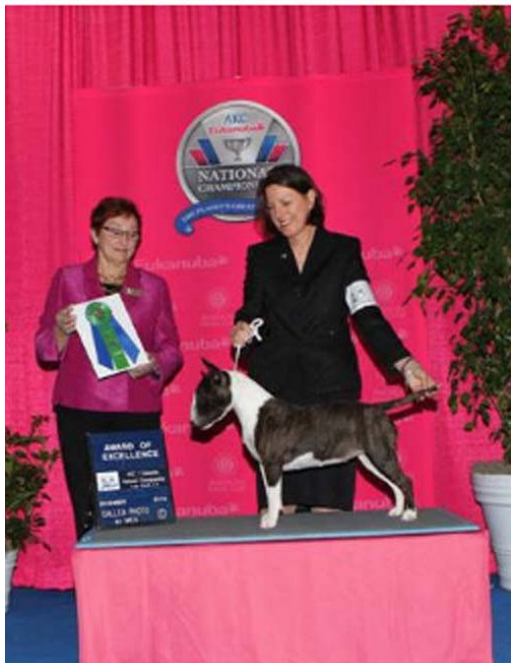
CH Menusha's What Little Girls R Made Of