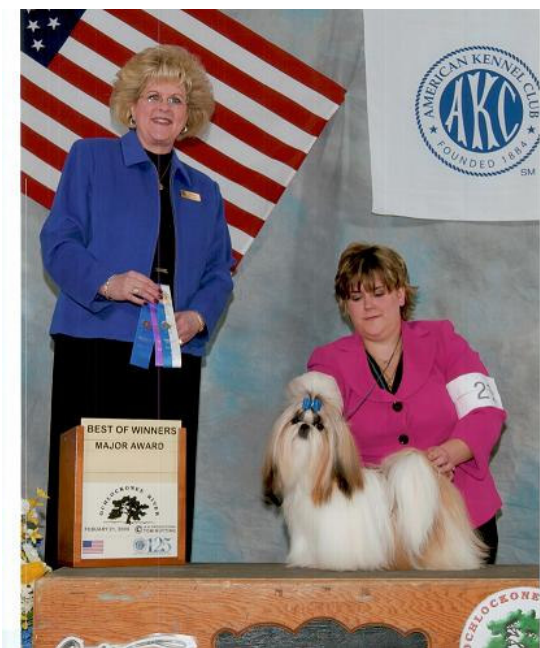
Ch. Demi's Say No More