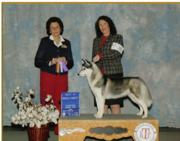
Kristari's Snow Gypsy at Baymar