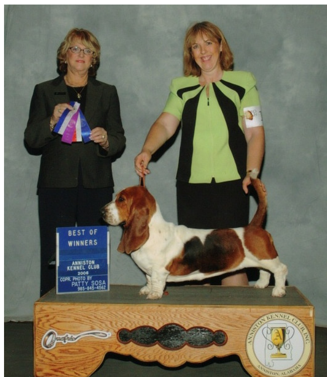
Ch. Monogram Wickedly Perfect