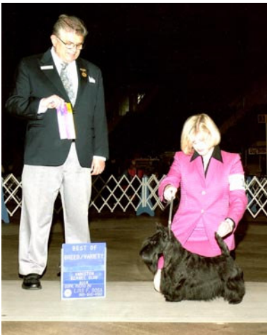
Ch. Charhill Celebration

Demi's Say No More, "Rumor" was Winners Dog at the Savannah shows on November 28 & 29th for his first points at 10 months old.